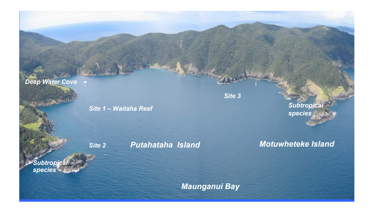
Figure 1: The 2007 survey sites in Maunganui Bay and the areas of subtropical species