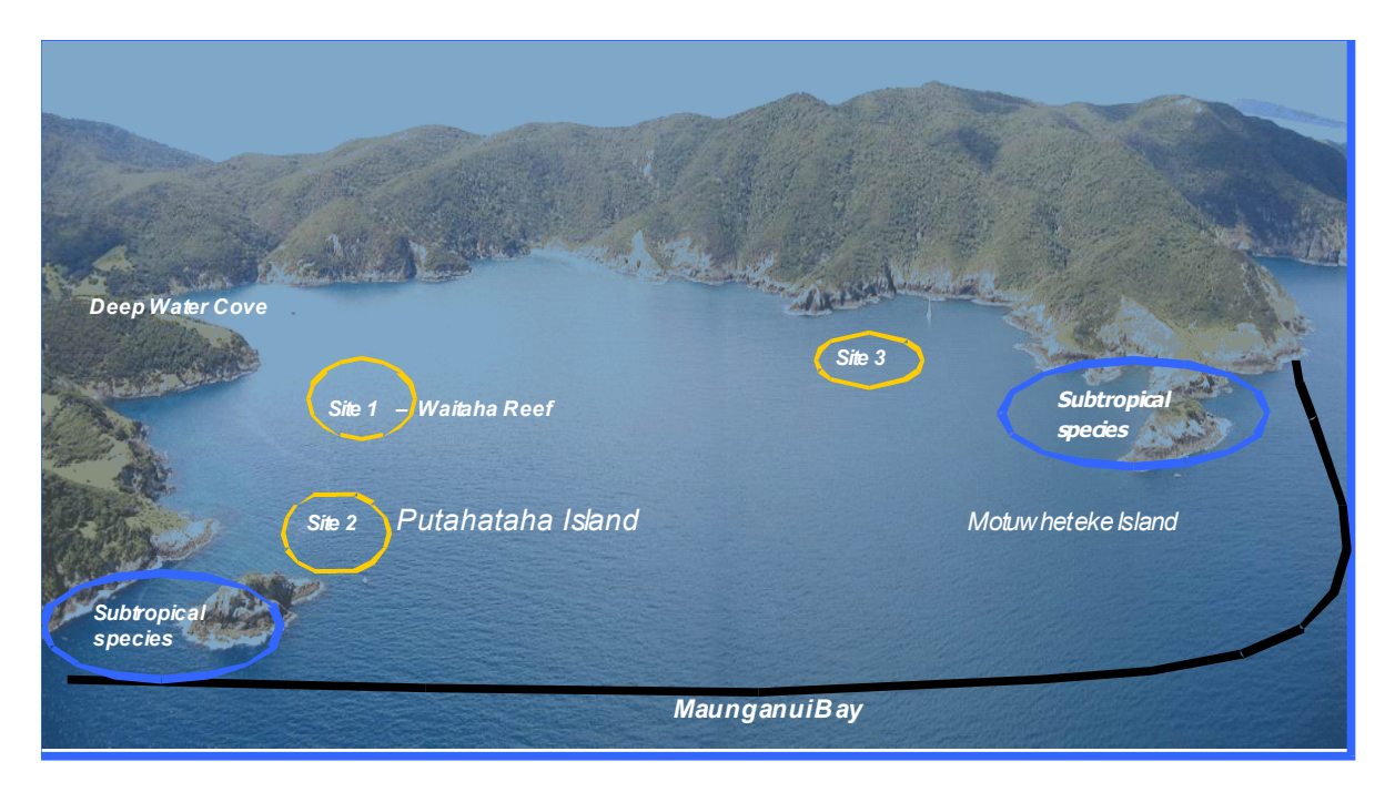
Figure 2: Proposed S186A area, the 2007 survey sites and the two areas of subtropical species

On the advice of the kuia and kaumätua, the recreational divers, some marine scientists and a hydrologist, Maunganui bay was selected to sink the ex-frigate Waitaha-Canterbury. To assess the value of the wreck as an artificial reef before the scuttling, Ngati Kuta and Patukeha, funded by the Ministry of Fisheries, completed a baseline study of the fishery in and around Maunganui Bay in 2007, called Te Kupenga Manawahuna study. The aim was to investigate what fish were in Maunganui bay historically, from the evidence of the kuia and kaumätua of Ngati Kuta and Patukeha ki Te Rawhiti and written records, compared with the present stocks found in surveys in Maunganui in 2007.