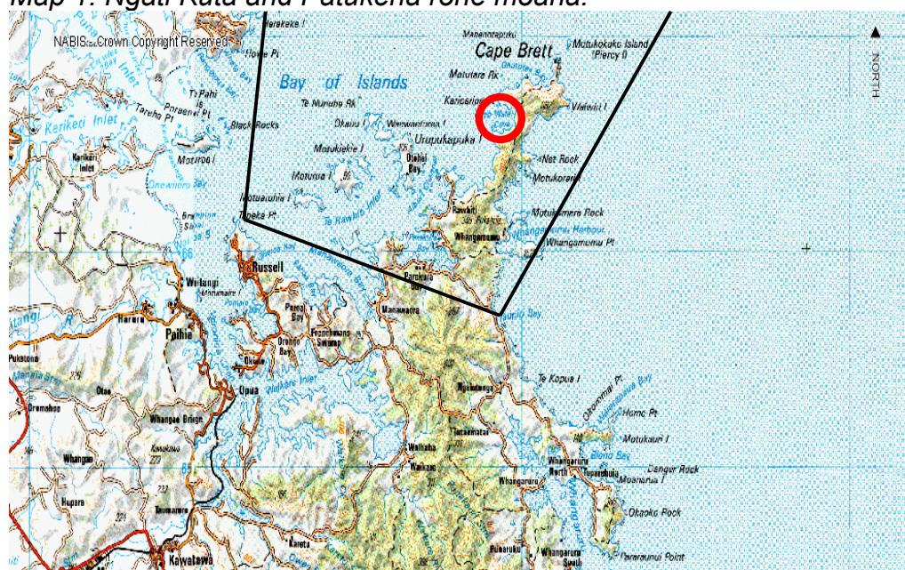
Map 1: Ngati Kuta and Patukeha rohe moana.

Our rohe kaitiakitanga begins at Taupiri on the eastern side to Tapeka in the west, from Wiwiki in the north to Motukokako in the south as set out in Map 1 below.