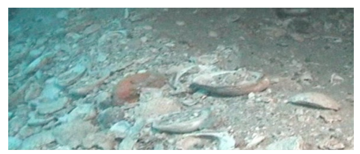
Figure 4: Shells under the wreck evidence that there were once shellfish in Maunganui

There are no paua in the bay but again the empty shells are there. There needs to be a project studying paua. Kina have been documented as capable of 'bulldozing' juvenile paua during their grazing.<sup>3</sup> The large starfish, astrostole scabra , are also known to eat paua.