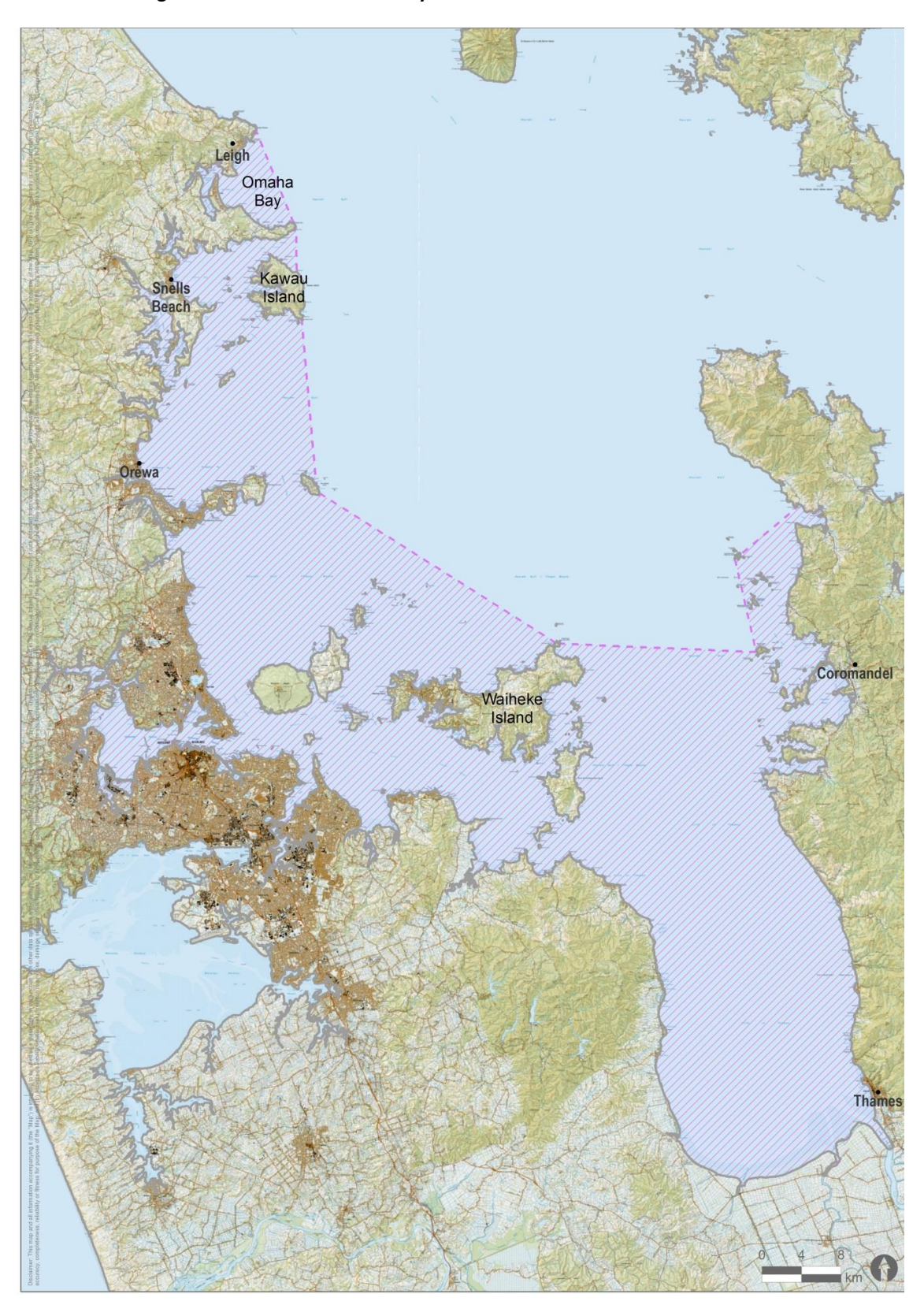
Map 1: Proposed location for a Hauraki Gulf Recreational Fishing Park based on Statistical Area 7 in Fisheries Management Area 1 and Omaha Bay