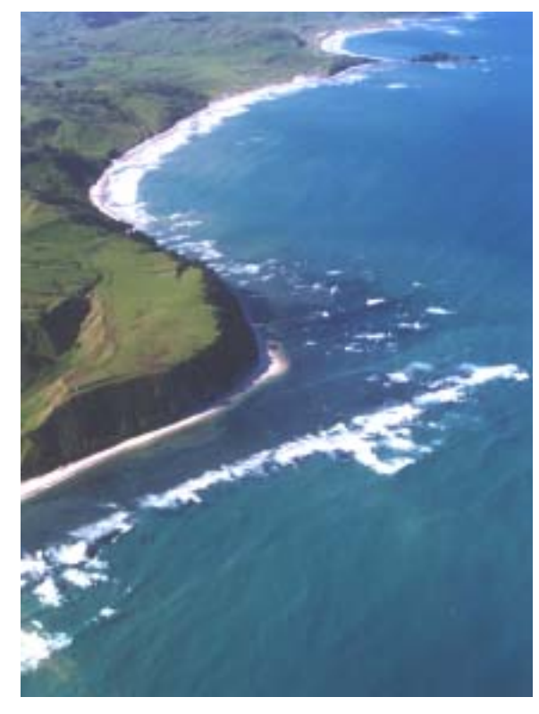
Pouawa to Te Ana o Paikea/Whangara Island.

Welcome to Te Tapuwae o Rongokako Marine Reserve. Established in 1999, the reserve is the result of many years of work by the joint applicants Ngati Konohi and the Department of Conservation. We hope you enjoy your visit to this very special part of the East Coast.