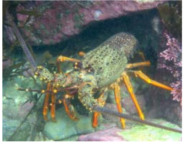
A crayfish.

The coast around Gisborne attracts high numbers of crayfish and as you explore the crevices and overhangs you may see hundreds of tiny crayfish, depending on the time of year. At between 10 and 20 metres depth, there are extensive kelp forests, which are home to many different fish species, such as scarlet wrasse (puwaiwhakarua), scorpionfish, sweep (hui) and leatherjackets (kokiri). Sponges, hydroids, anemones, soft corals and sea squirts thrive on the rock faces and overhangs.