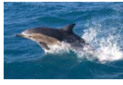
Common dolphin.

several dolphin and whale species are all regularly observed in the area.