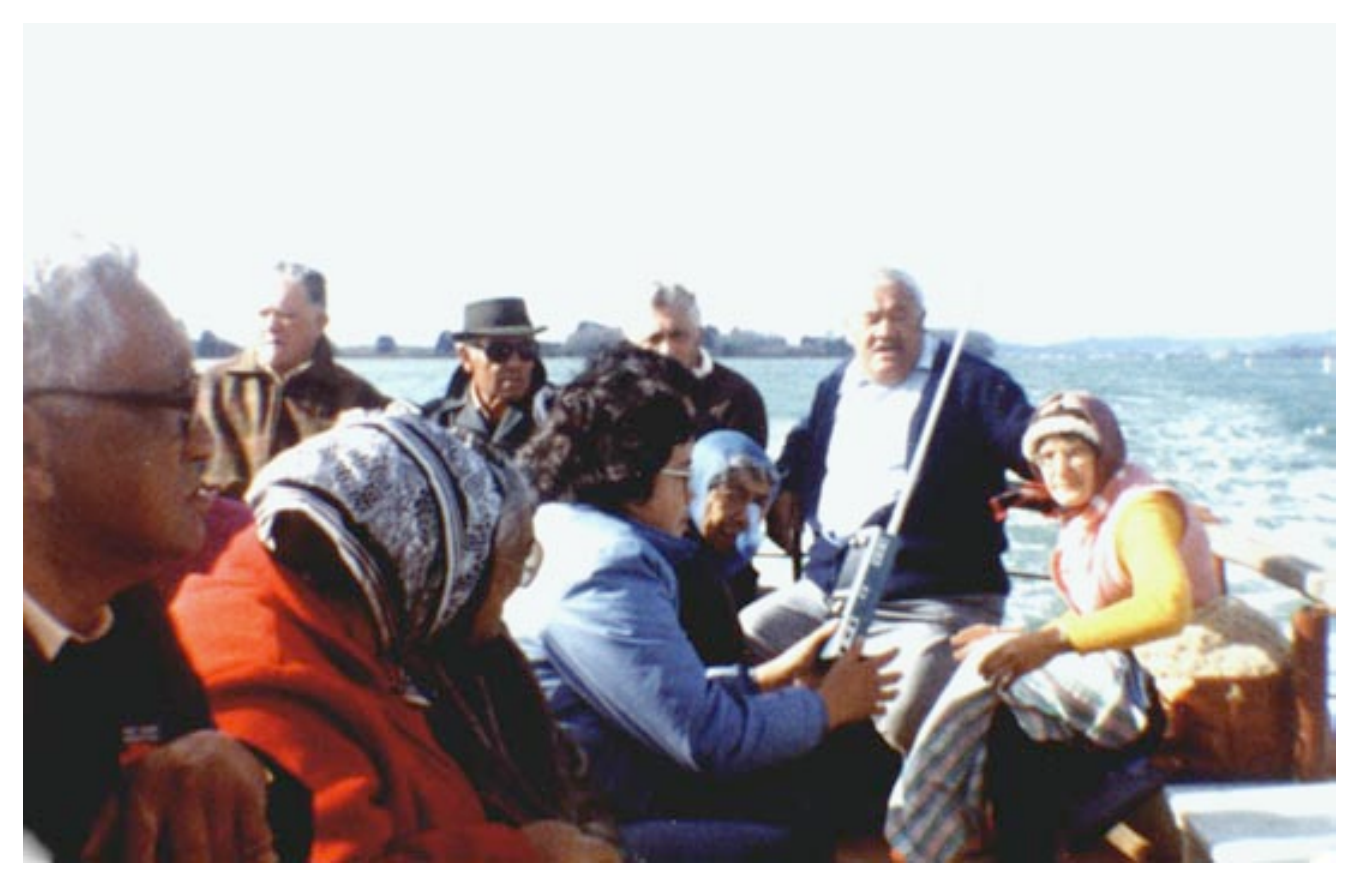
Kaumatua trip, early 1970s.

The koura ones for the sea had particular ways of being made as the inner was plaited by weaving it around your foot then removing your foot and attaching the inner to the inside of the hinaki. There was always jokes about whose foot was to be left in for bait! All these traps were tied to the top of the loads on the back of the trucks. What with all the kids we must have looked a real sight going over those hills and coming back! Those were really neat times!