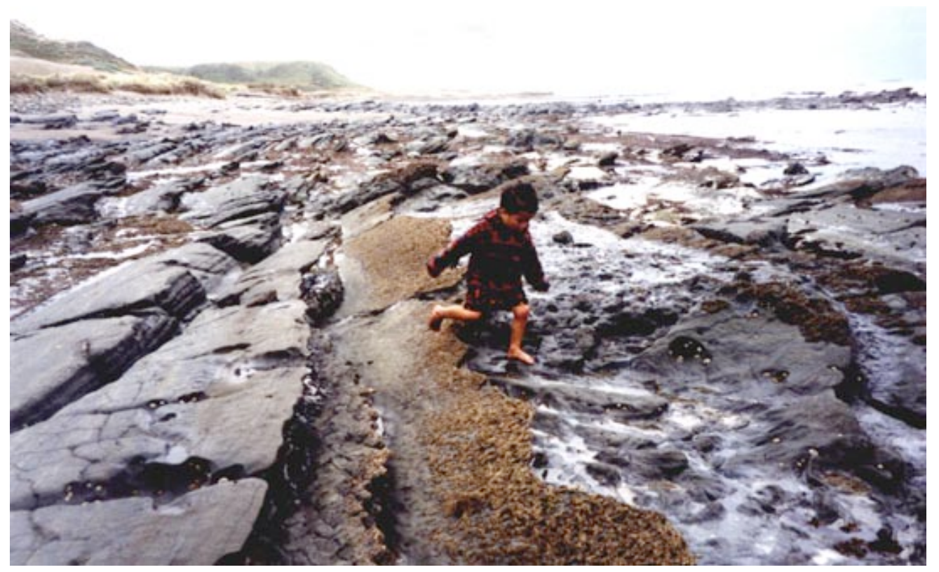
"Today's society has to be taught all of those things."