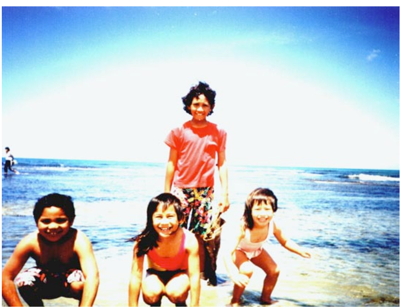
My mokos at Waikekeno.

Marine protection is everyone's responsibility. You can muck around in the sea for a couple of hours and get about two or three pauas and be glad to get that and be happy and just glad to get that.