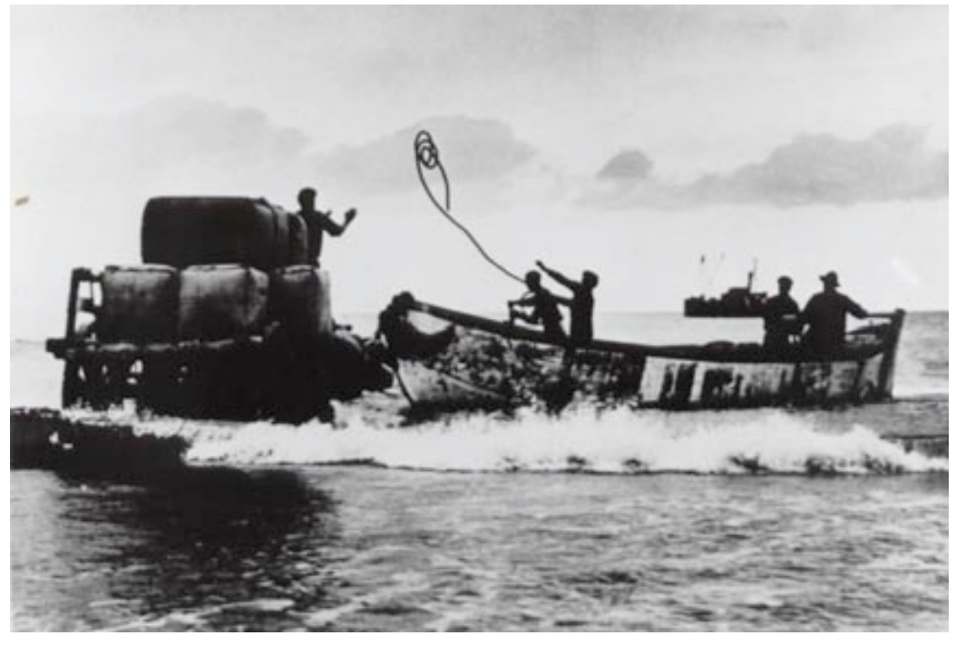
"They used to send 7,000 bales out by ship."

That was down the pa at Owahanga. Owahanga was leased until 1931. Native Maori Affairs took it back in 1931 and run it. Well I'm not too sure but my father said that there were about 500 Maori living there then – up and down the coast.