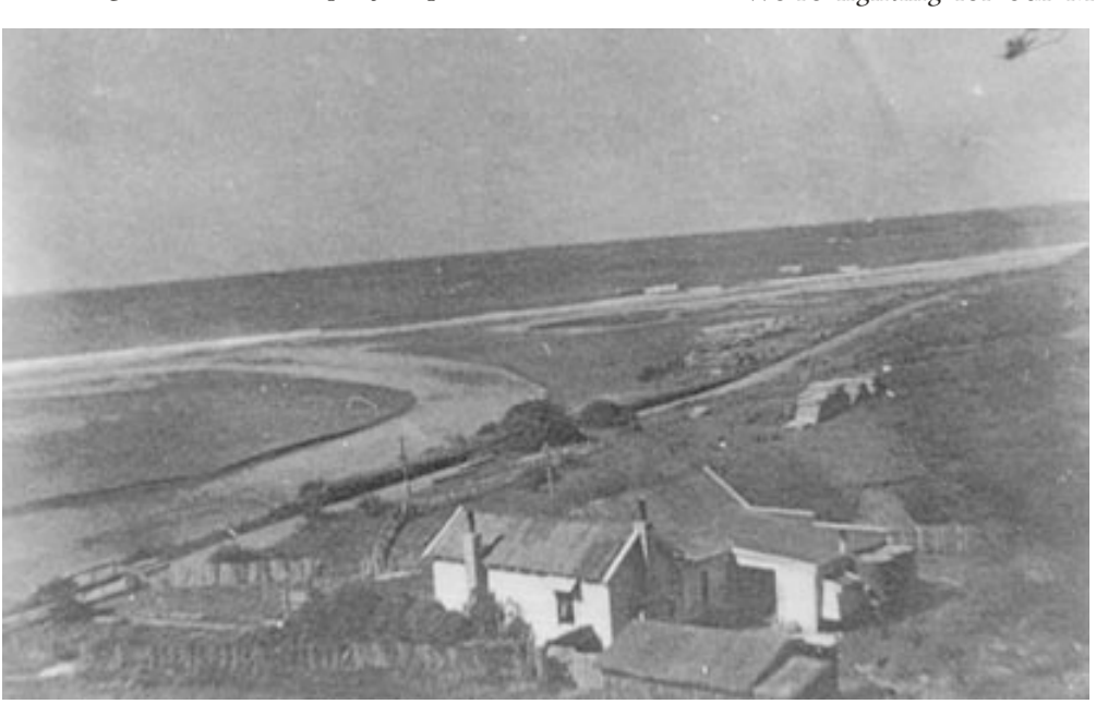
The old homestead, Akitio.

There's a massive groper reef out there off Akitio. Dad said "These old Maoris used to go up and find a totara somewhere up the river. Struck with lightning or something and died. They'd go hollow out the rot in the centre and he said they'd light it hoping it would hollow out and they would get a canoe. These big totaras would wash down then they'd split them, then just point both ends so it would pierce the water a bit". Now that hapuka reef is 5 miles out and he said they'd paddle out on and early outgoing tide in the morning and they'd catch a heap of groper and tie them on to their boat and then paddle back in. Dad said it was bloody awful. They'd have their legs hanging over each side with bloody great sharks following and he said they'd just paddle on!