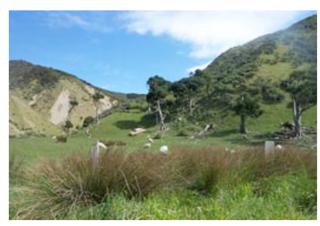
Hongi's Bay Mataikona showing karaka.

People used to dry the seafood in the old days. They would come out to the coast and camp. Inland Maori would come out to camp for two or three months at a time under the karaka trees. Everywhere they camped they planted the karaka trees. When the grader goes along the coast roads you can still see all their old middens with the black stones sticking out of the bank.