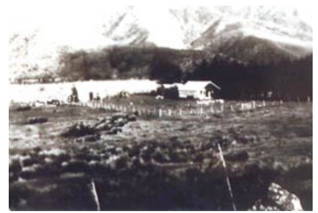
Marae Mataikona pre 1940.

When I left school the slump came on and I said to the old man "I'm going to get a job". He had five kids and enough to do feeding them. I was only 13 but that was the way it was. I had to go all the way to Porangahau to get a job. No one around here had any money! So I went up there and got sixteen shillings a week. Thought I was bloody made I suppose.